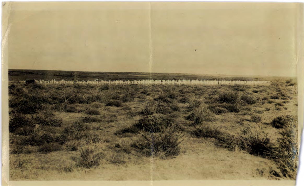
Redoubt Cemetery Cape Helles

The boy was a splendid soldier and died bravely and nothing can alter or diminish that.”